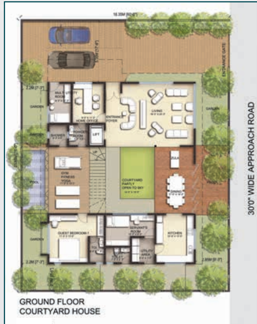
Built up area: 2234 sqft.