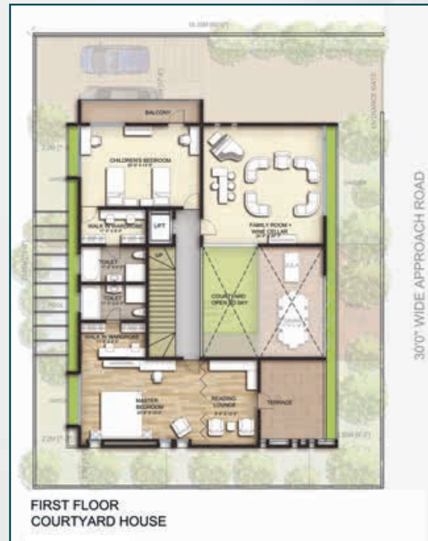
Built up area: 1970 sqft. (Excluding balconies)