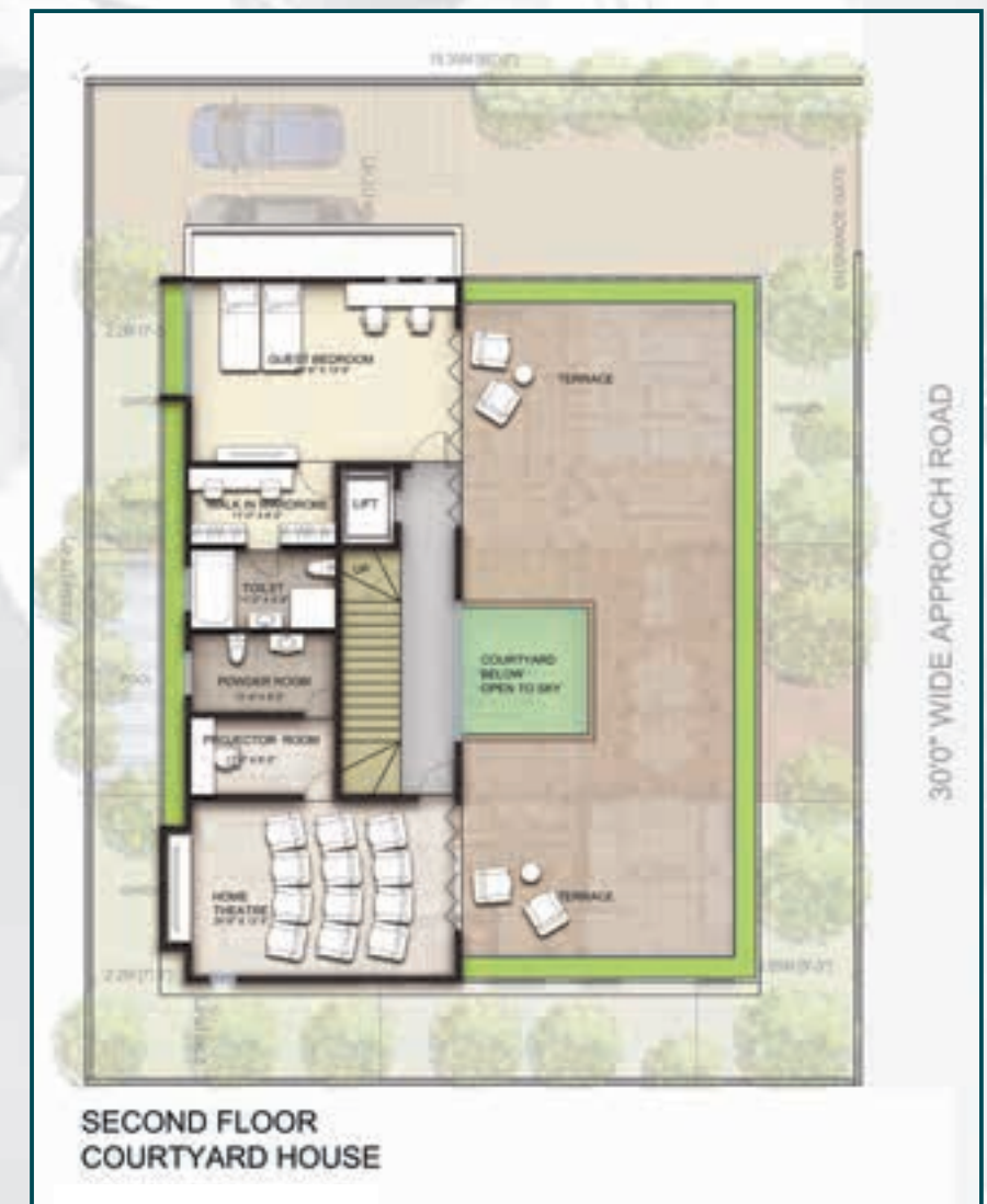
Built up area: 1155 sqft. (Excluding balconies, terraces)